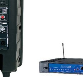
UHF amplified sound UI system Premio