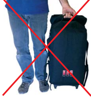
Do not use this handle to carry Xpresso.